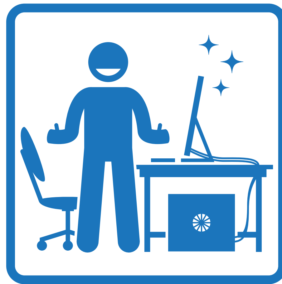
I WILL BE OKAY IF I GO TO SCHOOL ON THE COMPUTER.