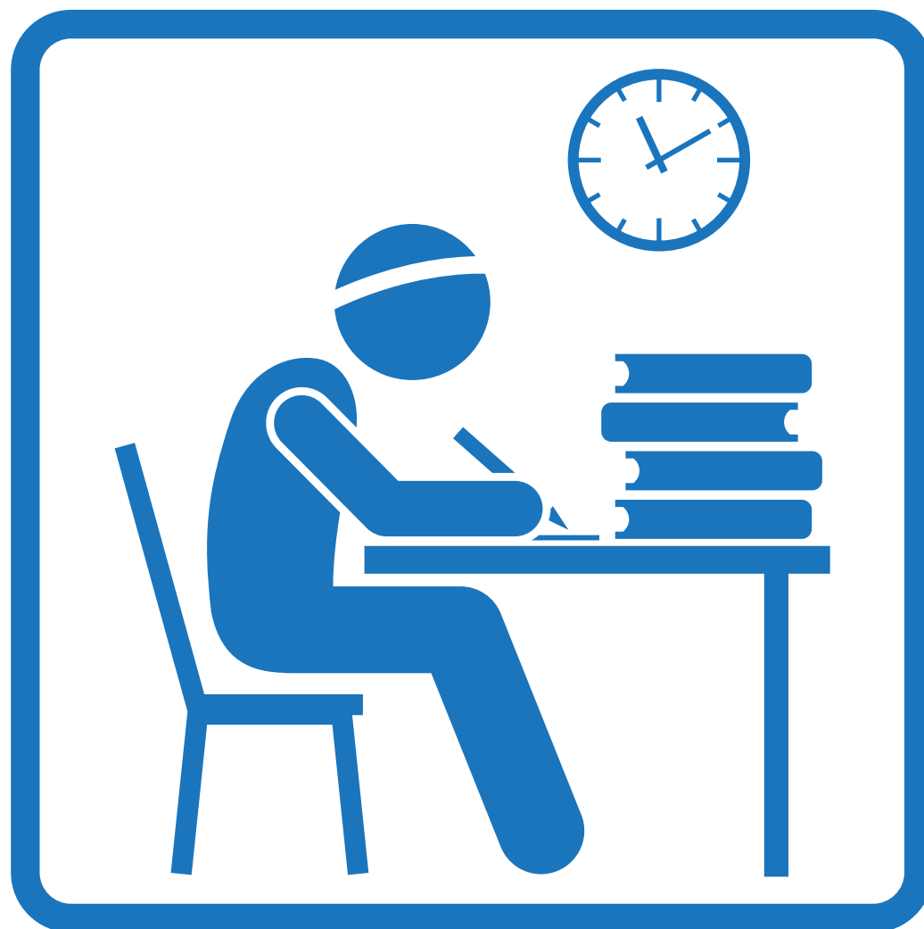
WINTER BREAK IS OVER AND IT'S TIME FOR SCHOOL.