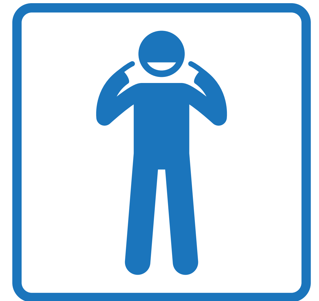
I WILL BE HAPPY, SAFE, AND LEARNING..