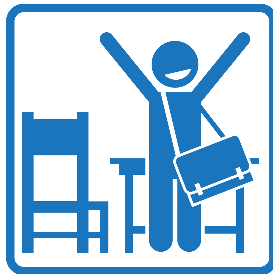
I WILL BE OKAY IF I GO BACK TO MY CLASSROOM.